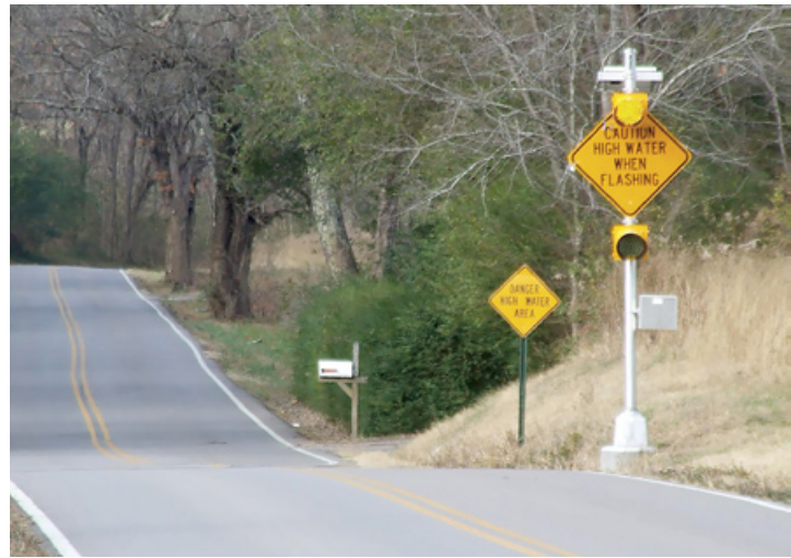
Advance high water warning — Road sensor around the corner