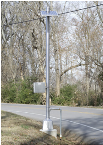
High water road sensor triggers advanced warning signals

ELTEC's system utilizes a pole mounted sensor housed in galvanized piping positioned at the desired high water detection point. When water touches the sensor level, the two stainless steel electrodes send a signal to the transmitter, which in turn activates the flashing road beacons. The LED's flash continuously as long as the flood waters are detected.