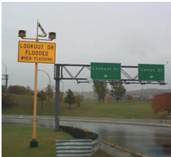
Detector pole with sensor and transmitter