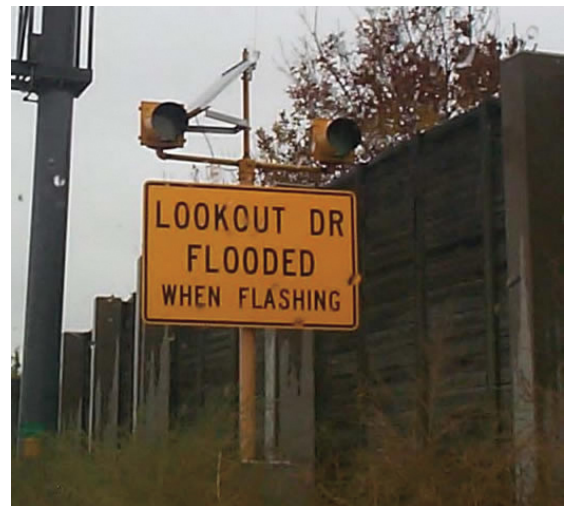
Pole on other side of road with receiver only