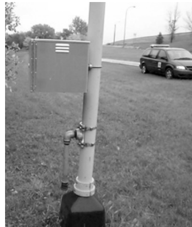
Sensor inside galvanized pipe

No moving parts; mechanical float switches can jam Immune to trash and debris Doesn't wear out (no mechanical float switches) Immune to corrosion/won't rust Operates in salt/sea, brackish and fresh waters Waterproof pole housing; wires not exposed to water Intrinsically Safe: no Sparks Activates flashing beacons as long as flood water is detected